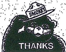
Exhibit No.: A-3 Hearing: EVERGREEN Date: 7-25-06 Submitted by: SCOTT TURNBULL